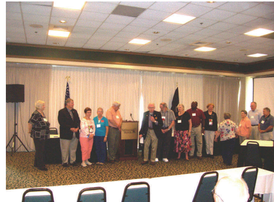
COLUMBIA, SC CHAPTER #87 VISIT TO CONGRESSMAN JOE WILSON (SC 2nd DISTRICT )